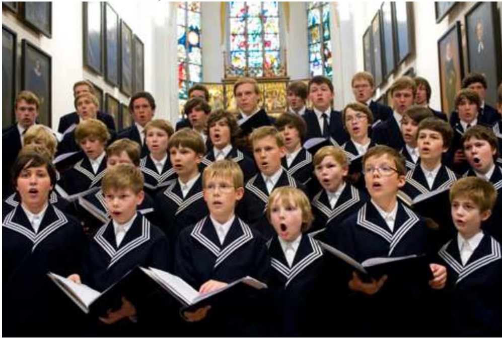
The Leipzig St. Thomas Boys Choir.

On Thursday night November 14 at the Notre Dame Basilica in historic Old Montréal, the Leipzig St. Thomas Boys Choir , 40 strong, will celebrate the Seventh Montreal Bach Festival by performing in Canada for the first time in its 800-year old history.