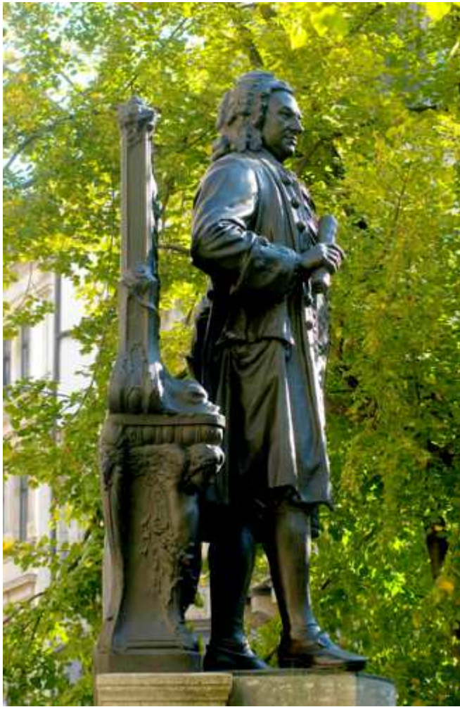
The Bach Monument in Leipzig.

In other words, it could be a B Minor Mass created uniquely for 21st century Montréal.